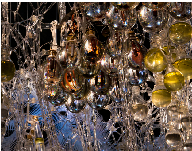
5 Epiphyte Spring - Hangzhou, China - 2013