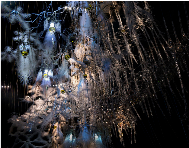
11 Epiphyte Spring - Hangzhou, China - 2013