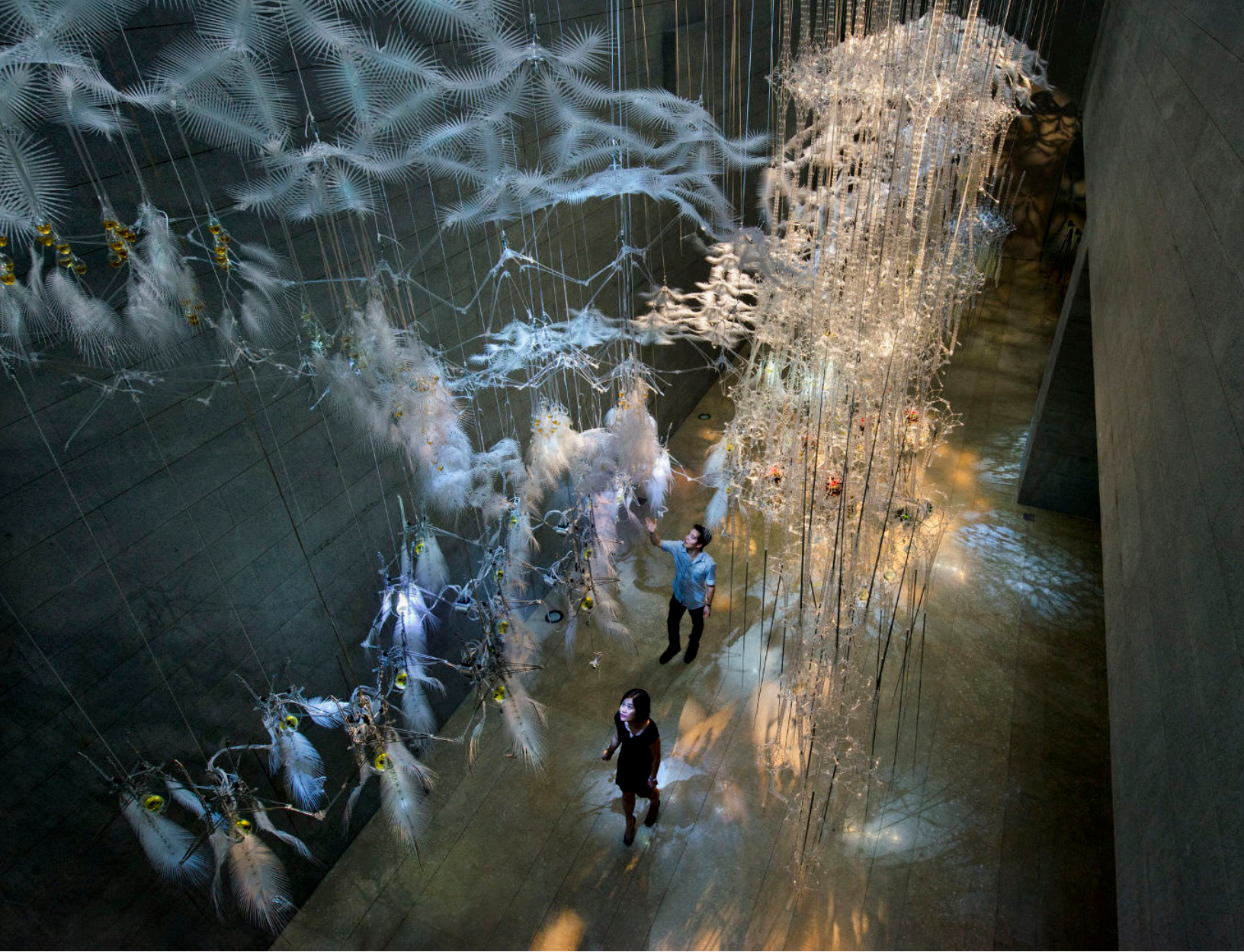
2 Epiphyte Spring - Hangzhou, China - 2013