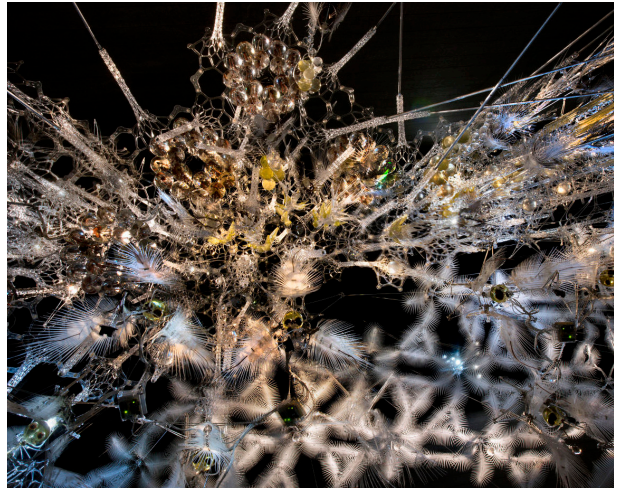
4 Epiphyte Spring - Hangzhou, China - 2013