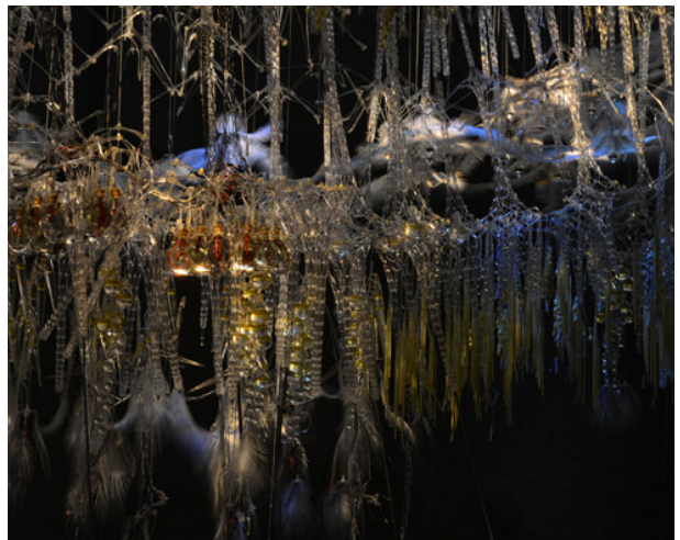
6 Epiphyte Spring - Hangzhou, China - 2013