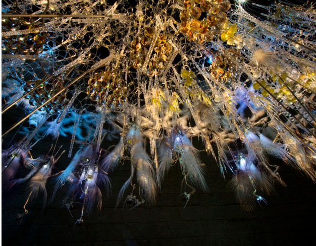
3 Epiphyte Spring - Hangzhou, China - 2013