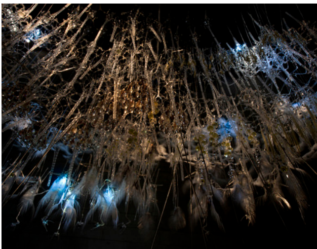
7 Epiphyte Spring - Hangzhou, China - 2013