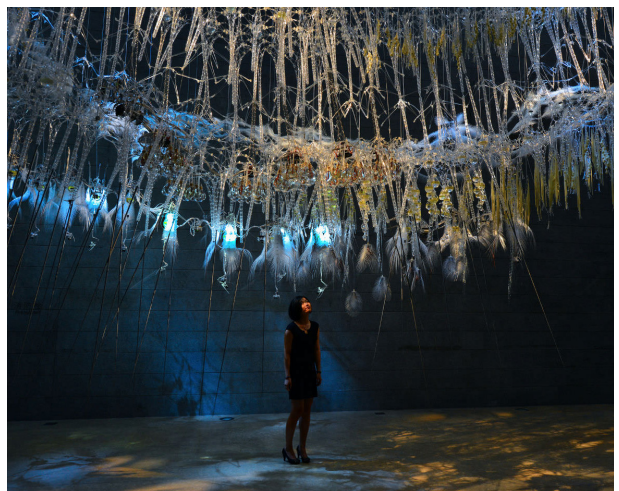
8 Epiphyte Spring - Hangzhou, China - 2013