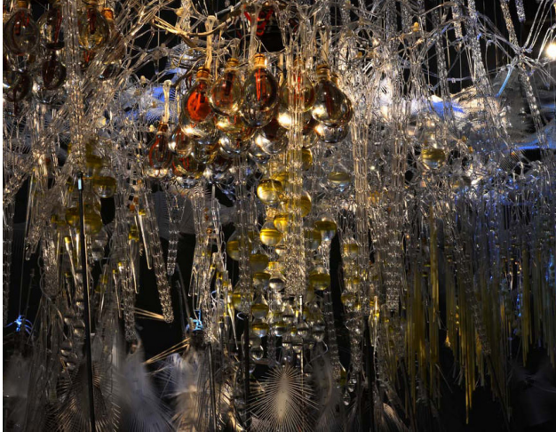
10 Epiphyte Spring - Hangzhou, China - 2013