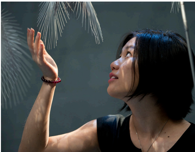
12 Epiphyte Spring - Hangzhou, China - 2013