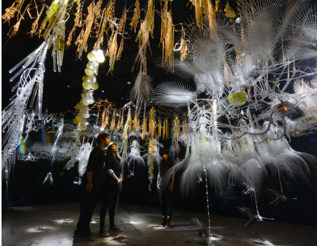
3 Protozell Cloud - Taipei, Taiwan - 2012.