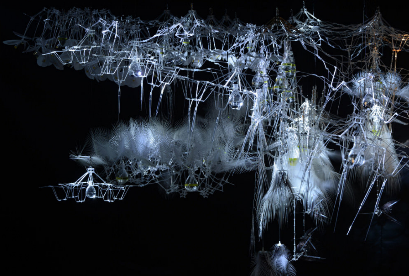
2 ProtoCell Cloud - Taipei, Taiwan - 2012.