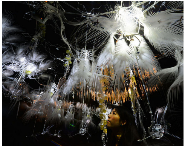
6 Protozell Cloud - Taipei, Taiwan - 2012.