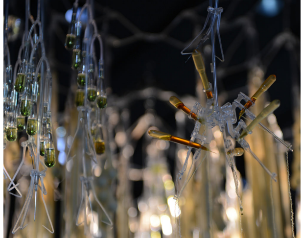
4 Protozell Cloud - Taipei, Taiwan - 2012.