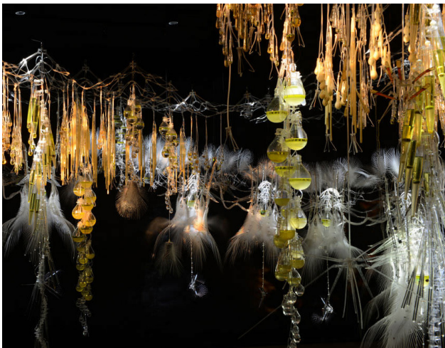
7 Protozell Cloud - Taipei, Taiwan - 2012.