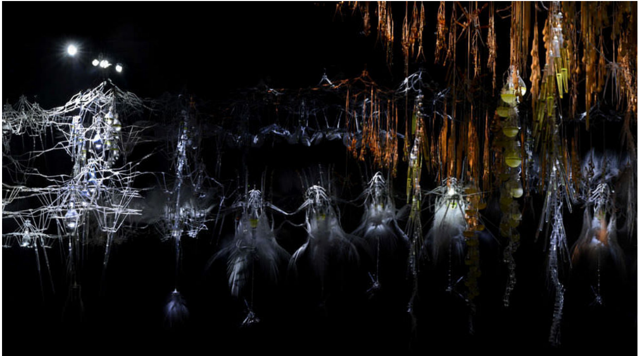
I ProtoCell Cloud - Taipei, Taiwan - 2012.