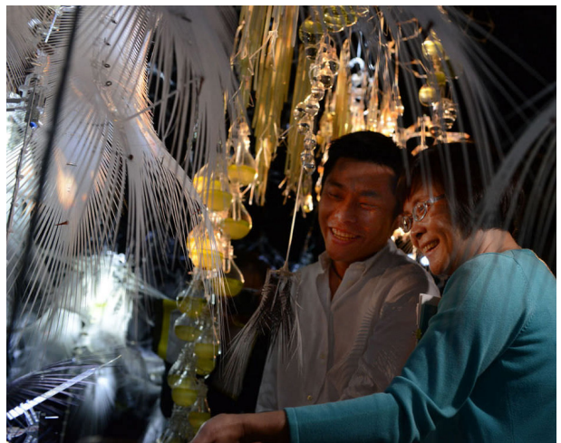
8 Protozell Cloud - Taipei, Taiwan - 2012.