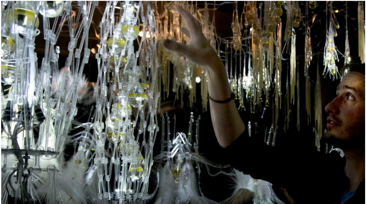
I Epiphyte Grove, Trondheim, Norway - 2012

Philip Beesley Living Architecture Systems Group