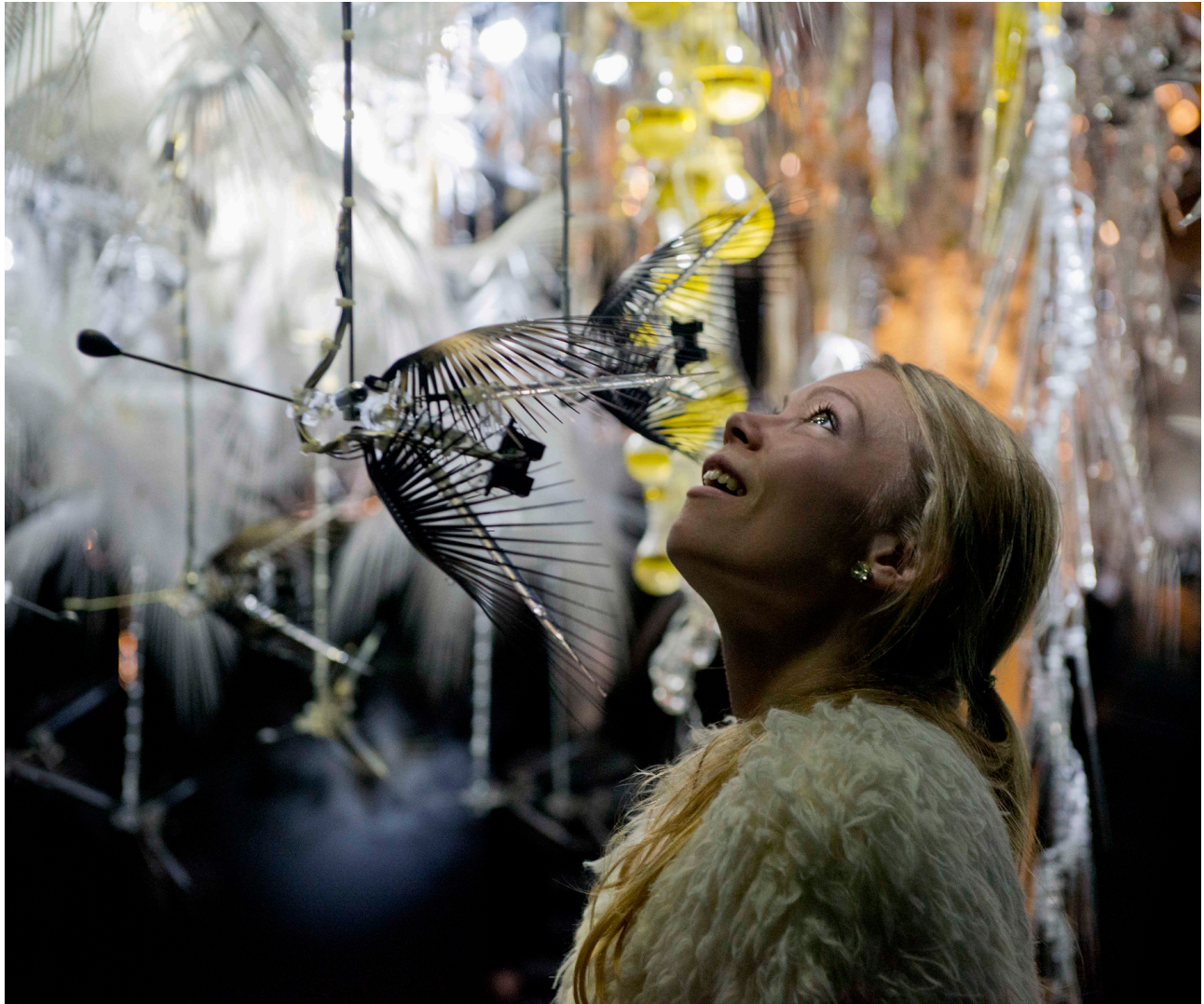
3 Epiphyte Grove, Trondheim, Norway - 2012