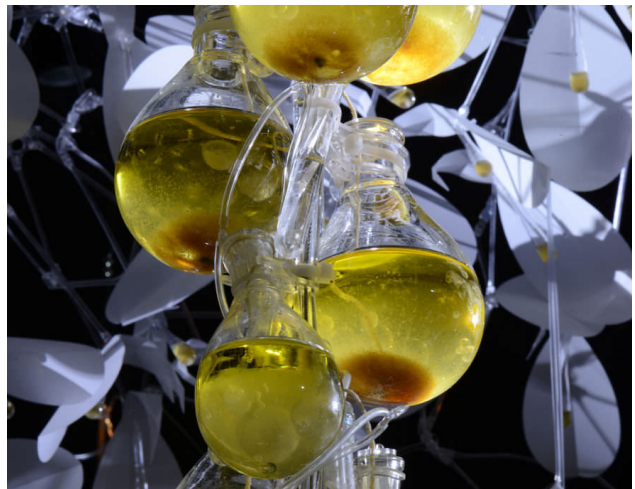
5 Epiphyte Grove, Trondheim, Norway - 2012