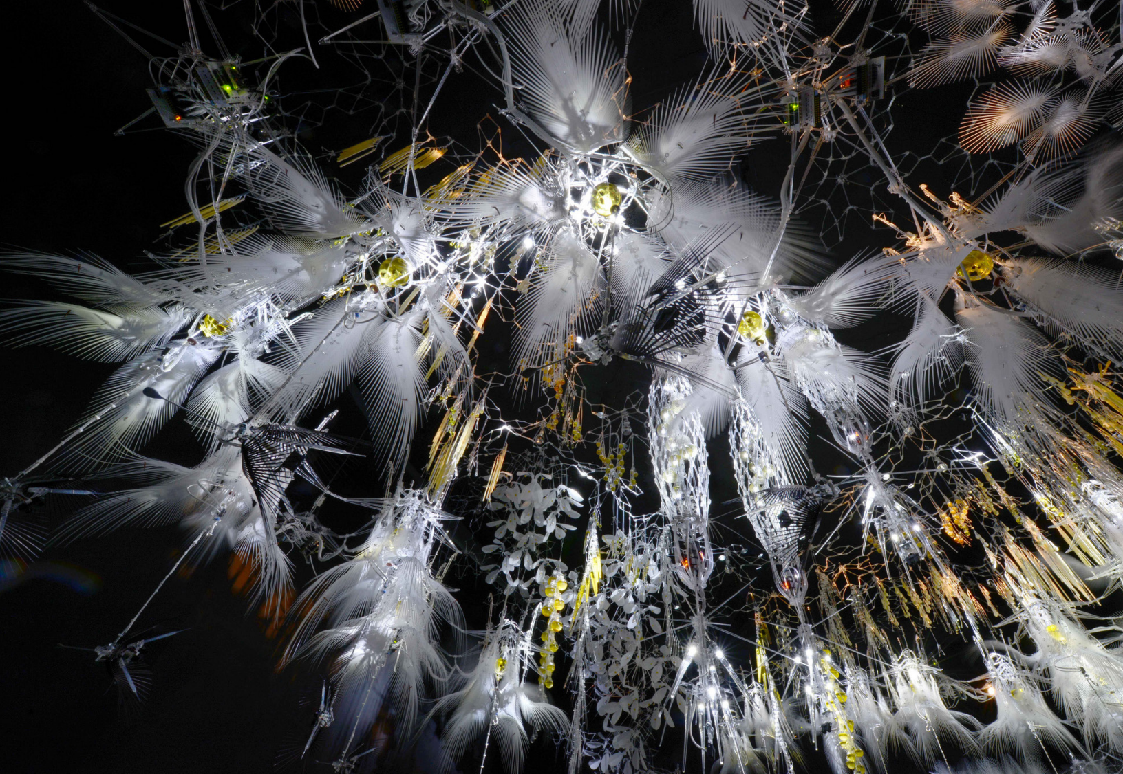
2 Epiphyte Grove, Trondheim, Norway - 2012