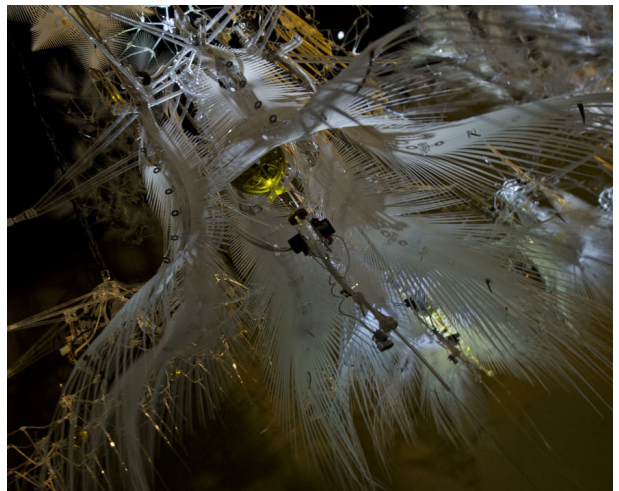
7 ProtoCell Field, installation view. Rotterdam, Netherlands - 2012.