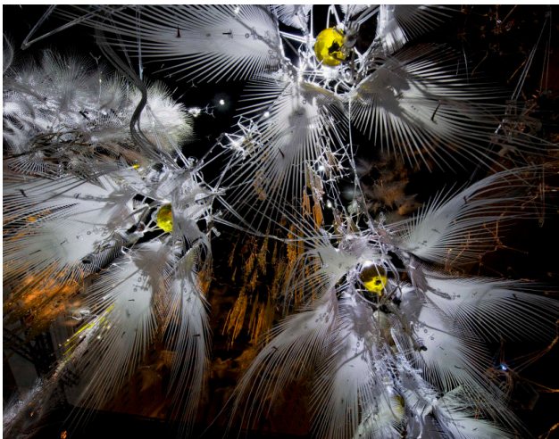
4 ProtoCell Field, installation view. Rotterdam, Netherlands - 2012.