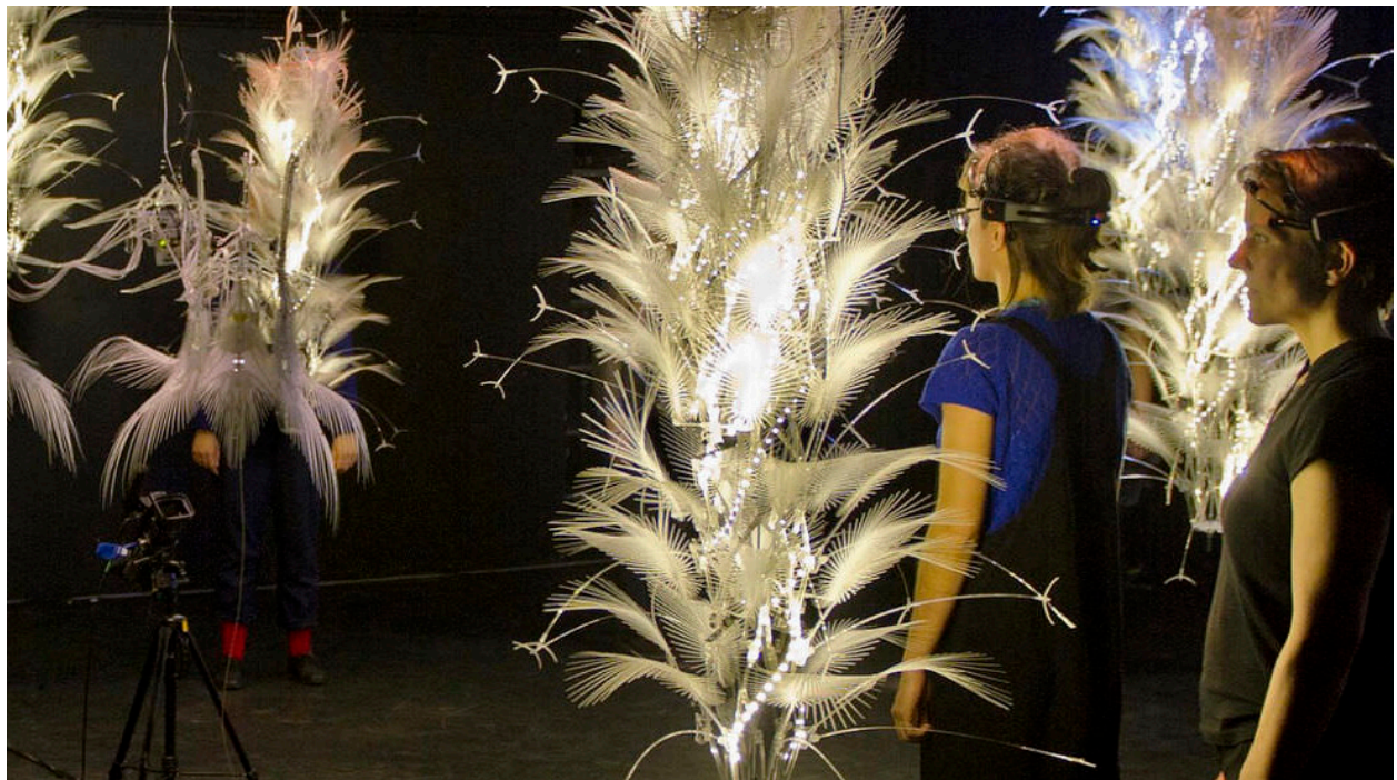
I ProtoCell Field, installation view. Rotterdam, Netherlands - 2012.