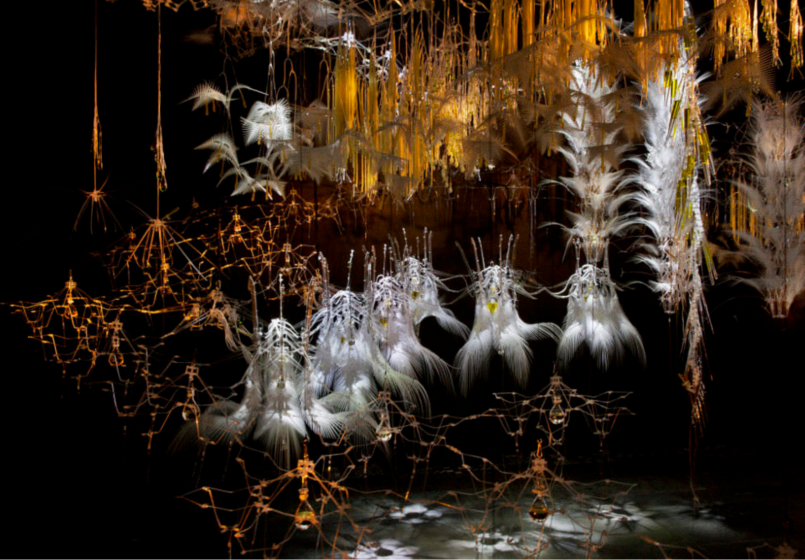
2 ProtoCell Field, installation view. Rotterdam, Netherlands - 2012.