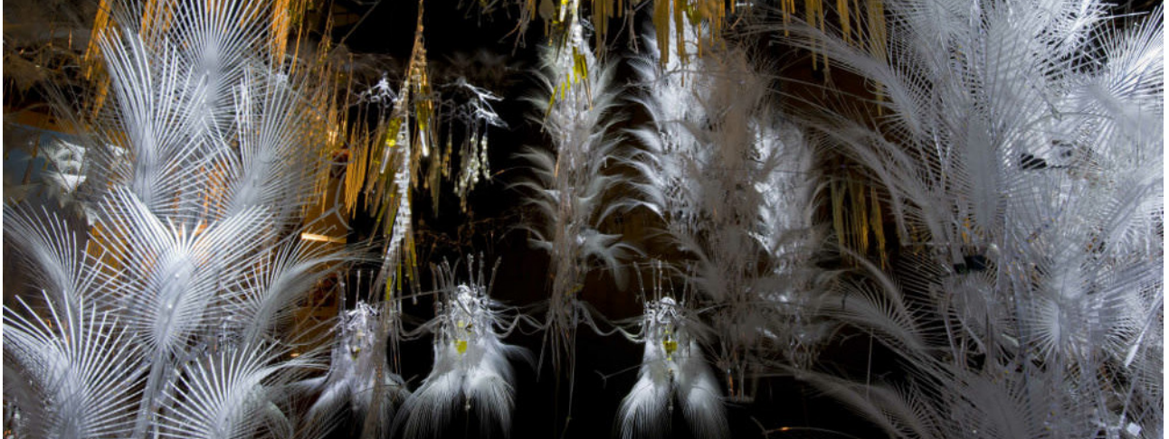
3 ProtoCell Field, installation view. Rotterdam, Netherlands - 2012.