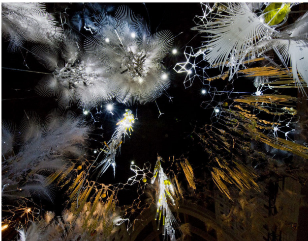
6 ProtoCell Field, installation view. Rotterdam, Netherlands - 2012.