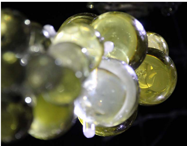
4 Hylozoic Series: Vesica. City Gallery, Wellington, New Zealand - 2012