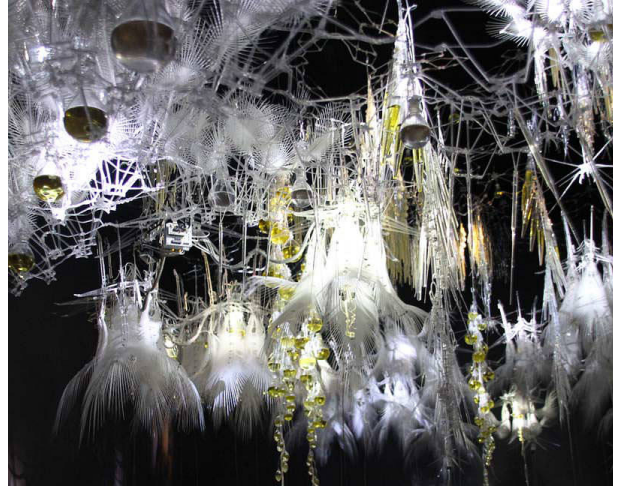
5 Hylozoic Series: Vesica. City Gallery, Wellington, New Zealand - 2012