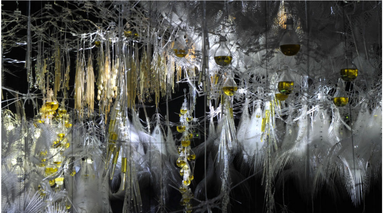
I Hylozoic Series: Vesica. City Gallery, Wellington, New Zealand - 2012