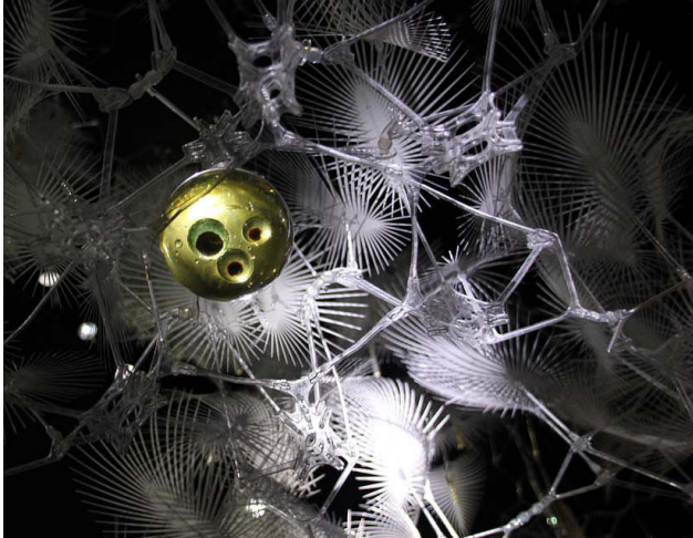
6 Hylozoic Series: Vesica. City Gallery, Wellington, New Zealand - 2012