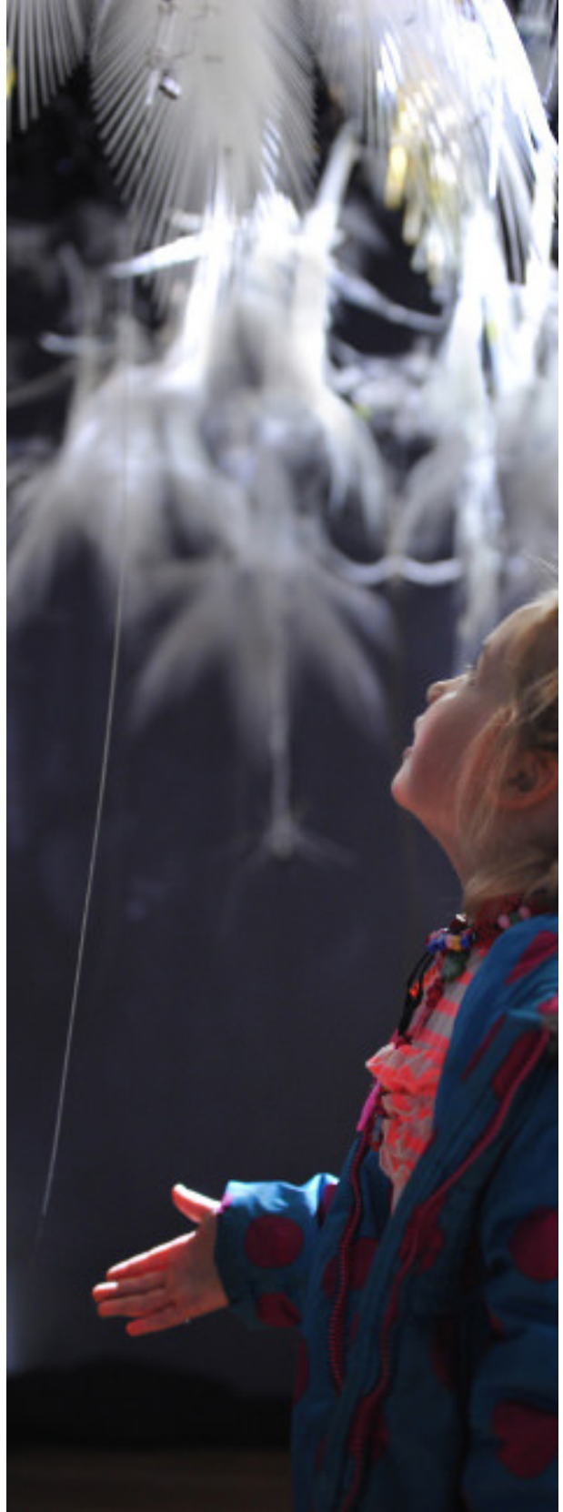
8 Hylozoic Series: Vesica. City Gallery, Wellington, New Zealand - 2012