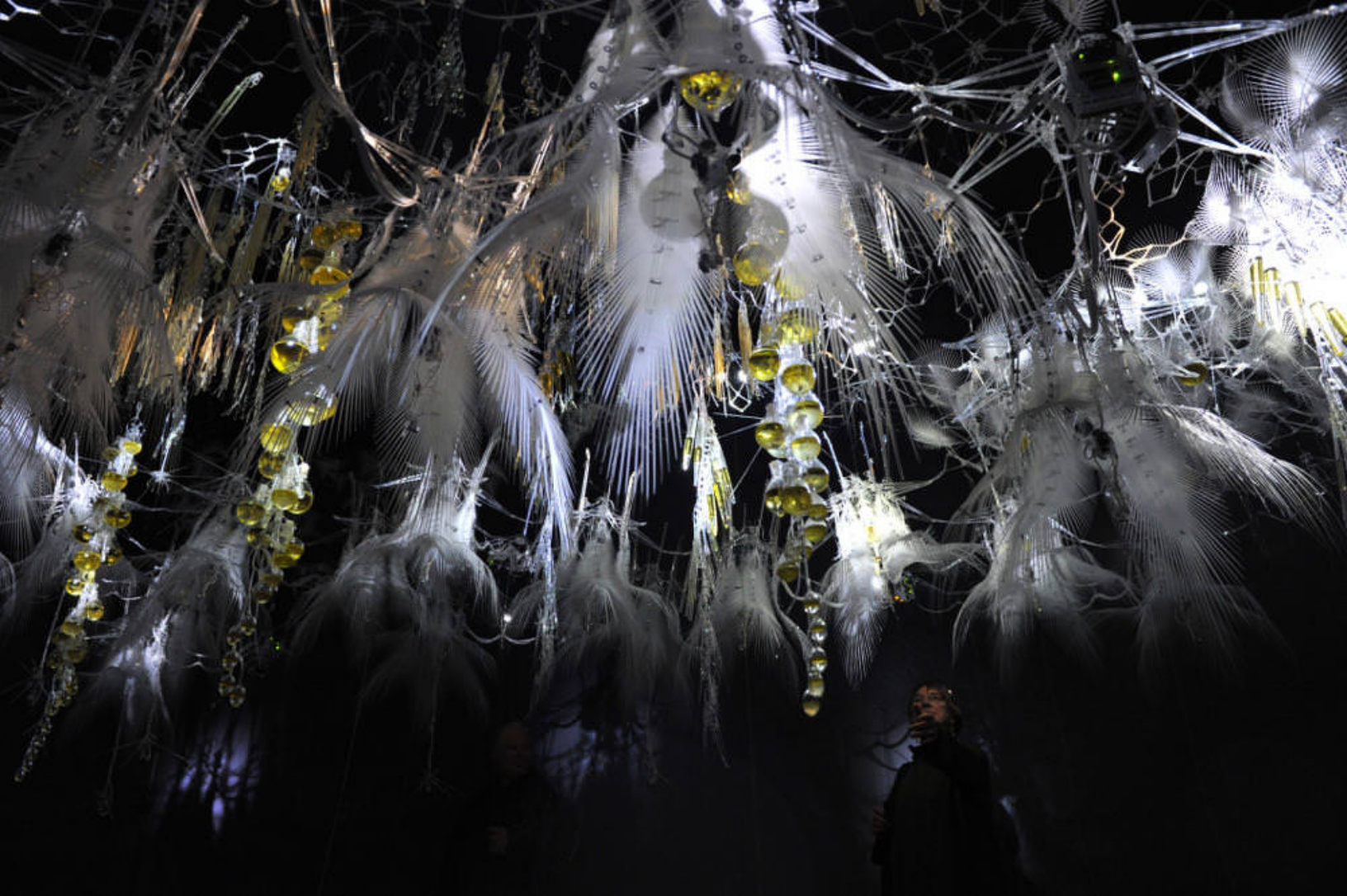
2 Hylozoic Series: Vesica. City Gallery, Wellington, New Zealand - 2012