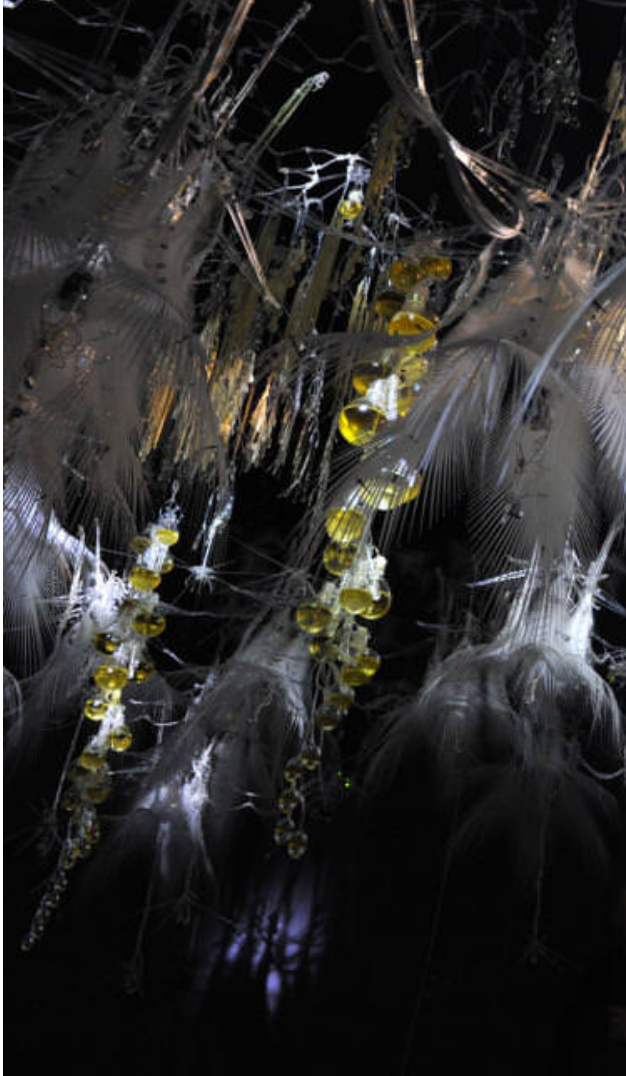
3 Hylozoic Series: Vesica. City Gallery, Wellington, New Zealand - 2012