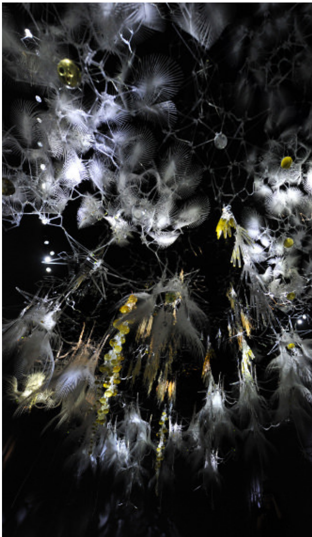
7 Hylozoic Series: Vesica. City Gallery, Wellington, New Zealand - 2012