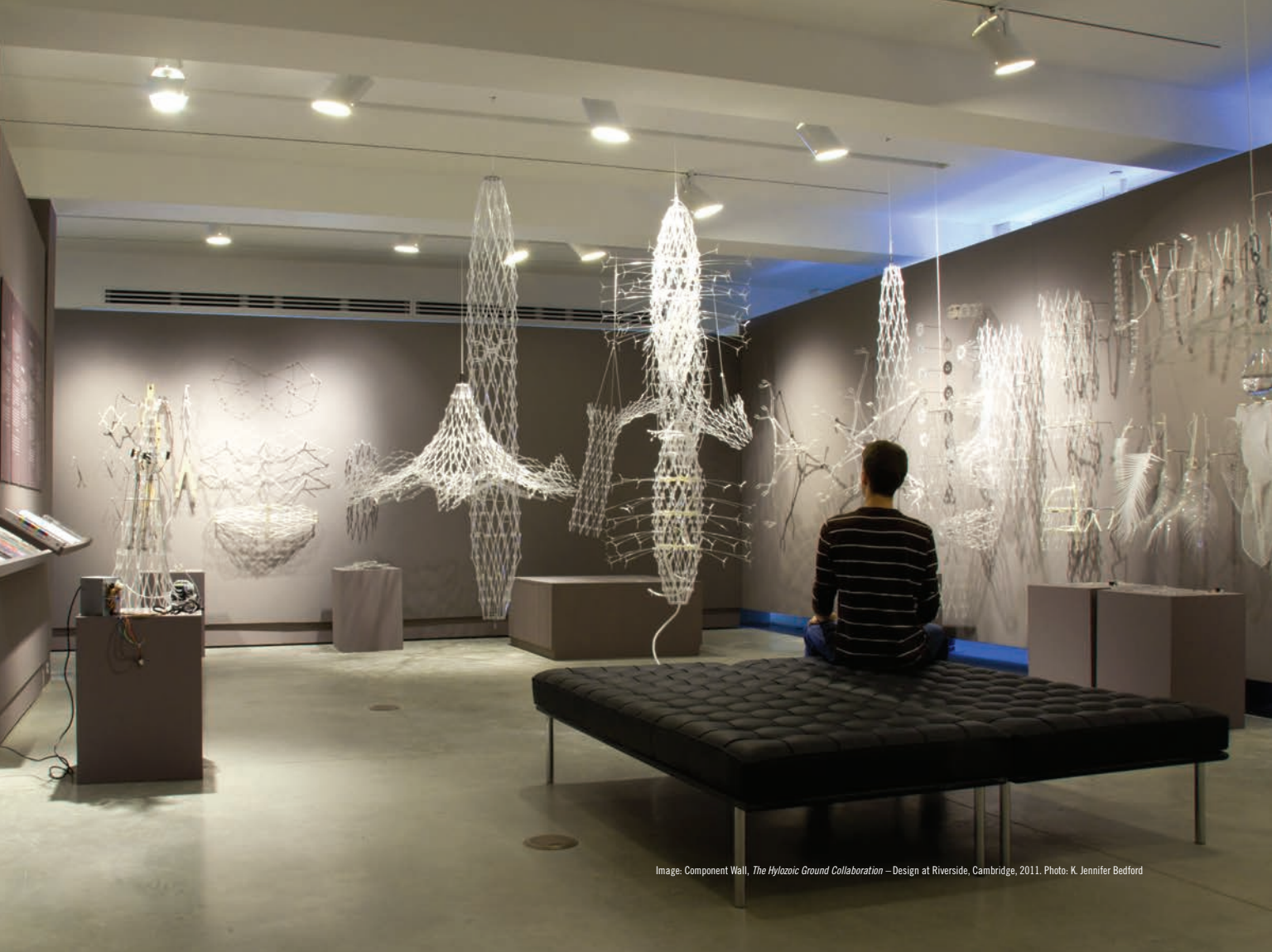
Image: Component Wall, The Hylozoic Ground Collaboration — Design at Riverside, Cambridge, 2011.