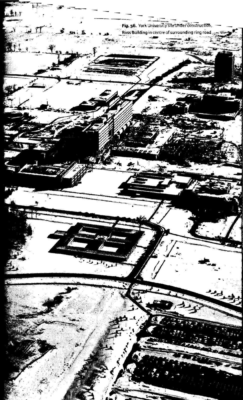
Fig. 56. York University site under construction, Ross Building in centre of surrounding ring road