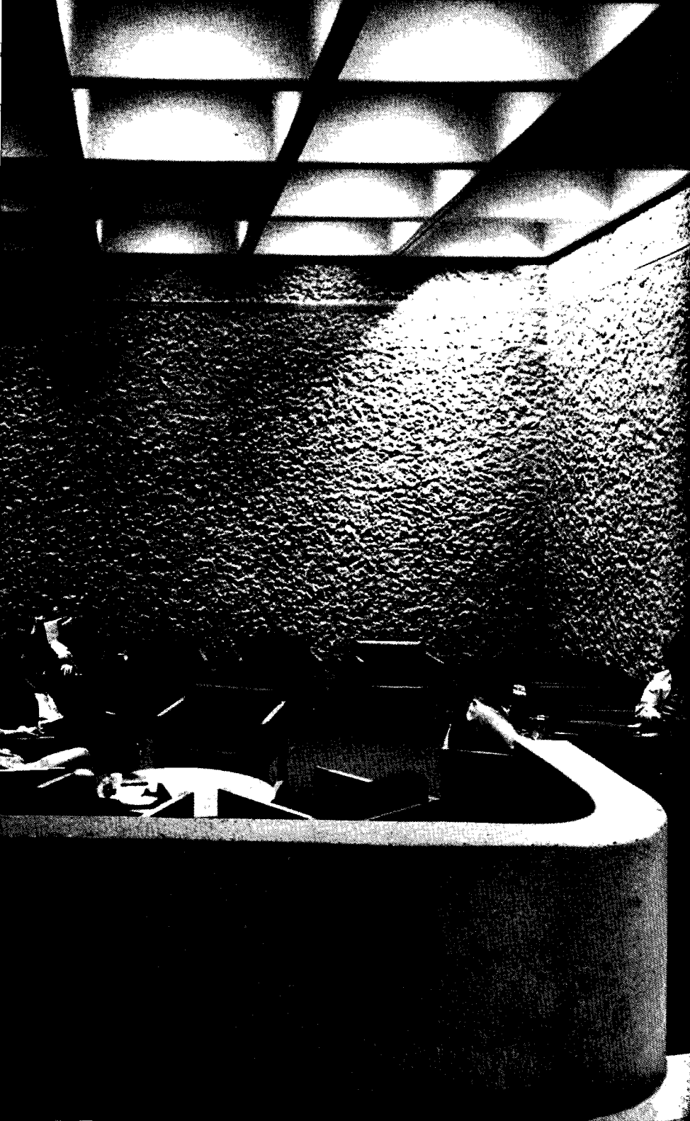
Fig. 57. Student lounge, Ross Building