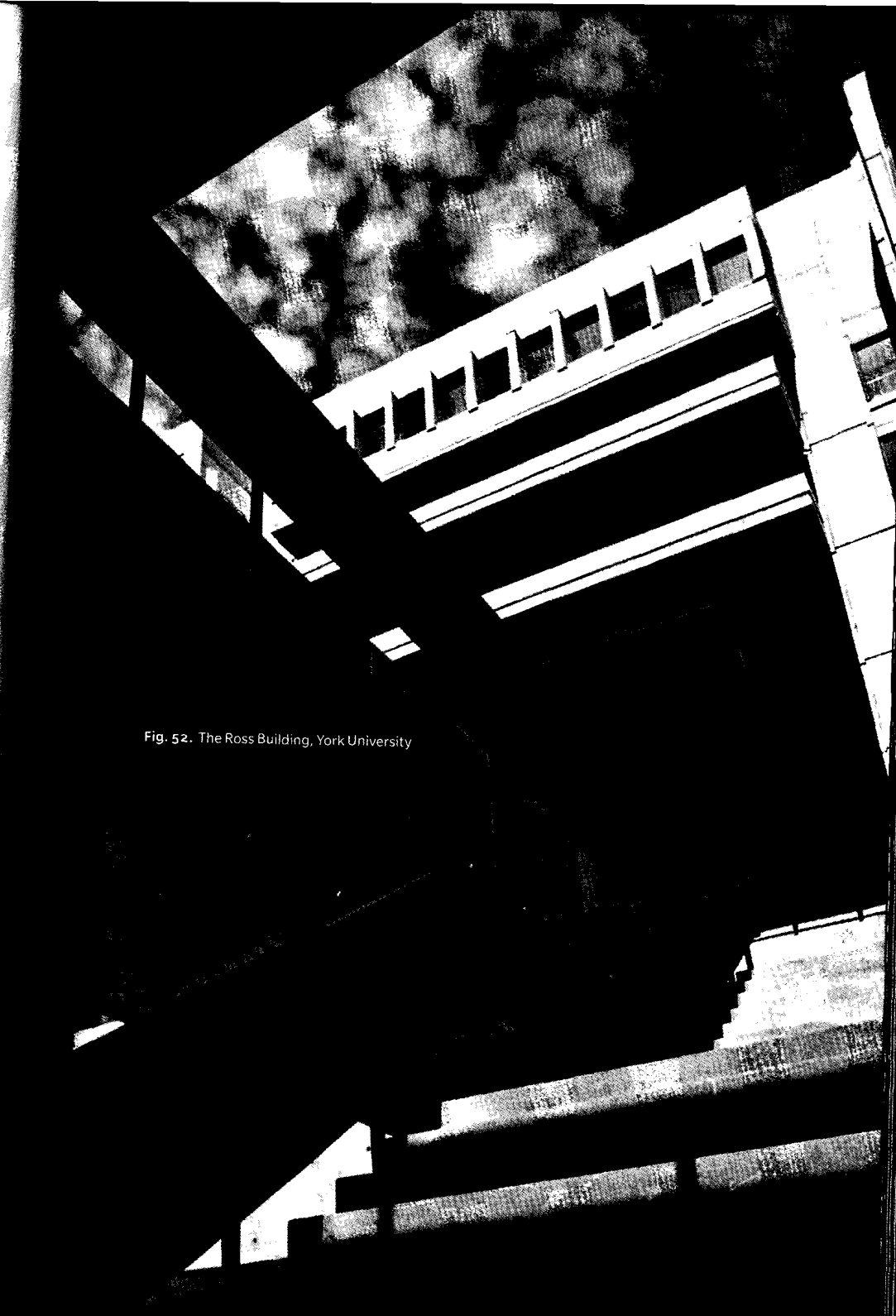
Fig. 52. The Ross Building, York University

The project shares an architectural language with contemporary projects – Wallace K. Harrison's soaring acropolis of Albany, New York (begun 1965) and the lofty piers of Le Corbusier's Chandigarh (1950–65). Like those projects, the sheer primal force of the Ross Building's structural frame was conceived as a kind of counterpoint, an archaic foundation supporting the turbulent action of a free new society. Amidst the corn and potato fields of Southern Ontario, the York University designers conceived a foundation rite