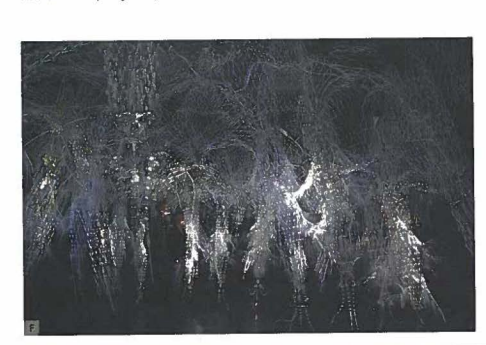
F, G, AND H The interactive geotextile mesh "senses" people in proximity to it and responds with peristaltic wave movements, appearing to "breathe" around its occupants.

becomes increasingly difficult in components cut from the thickest acrylic, since the diameter of a slot at its upper edge may be significantly wider than that at the lower. Given this eccentricity of laser-cut pieces, thinner IR acrylic stock material is selected wherever possible; this has the added henefit of reducing weloft and cutting time.