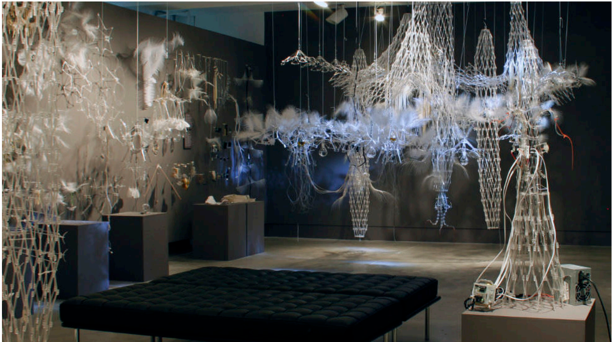
I Hylozoic Ground Collaboration: Cambridge Galleries - Cambridge, Canada - 2011