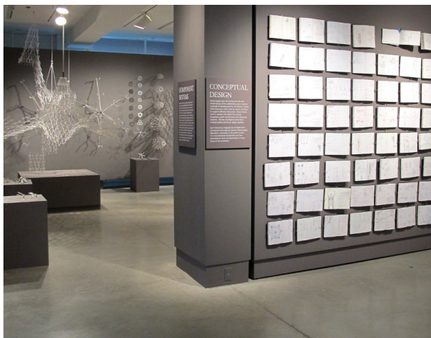
8 Hylozoic Ground Collaboration: Cambridge Galleries - Cambridge, Canada - 2011