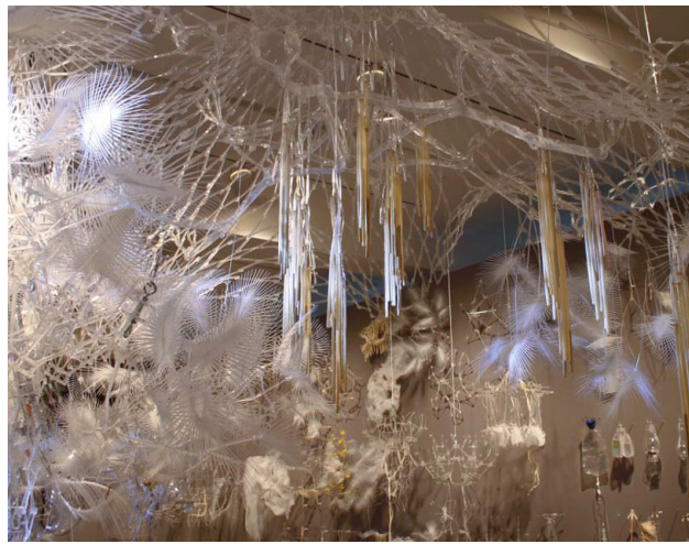
4 Hylozoic Ground Collaboration: Cambridge Galleries - Cambridge, Canada - 2011