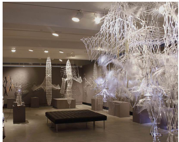
9 Hylozoic Ground Collaboration: Cambridge Galleries - Cambridge, Canada - 2011