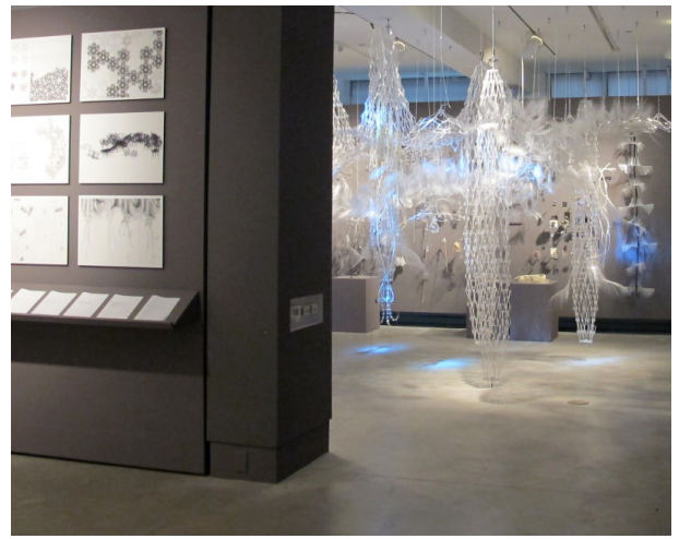
5 Hylozoic Ground Collaboration: Cambridge Galleries - Cambridge, Canada - 2011