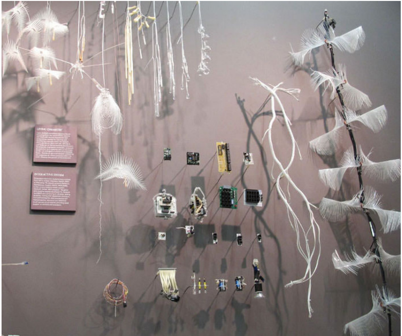
7 Hylozoic Ground Collaboration: Cambridge Galleries - Cambridge, Canada - 2011