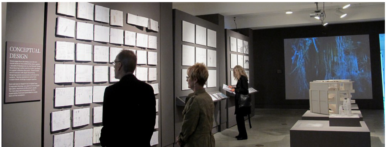
6 Hylozoic Ground Collaboration: Cambridge Galleries - Cambridge, Canada - 2011