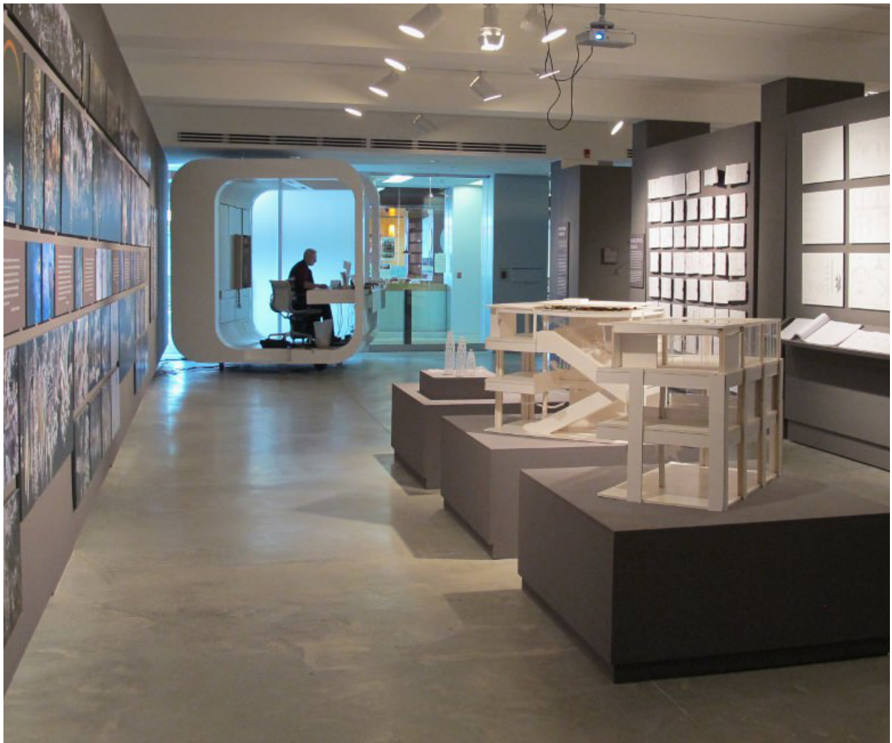
11 Hylozoic Ground Collaboration: Cambridge Galleries - Cambridge, Canada - 2011