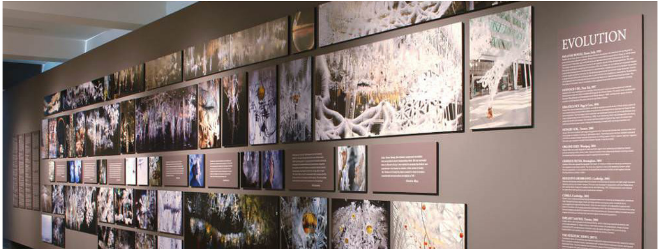
3 Hylozoic Ground Collaboration: Cambridge Galleries - Cambridge, Canada - 2011