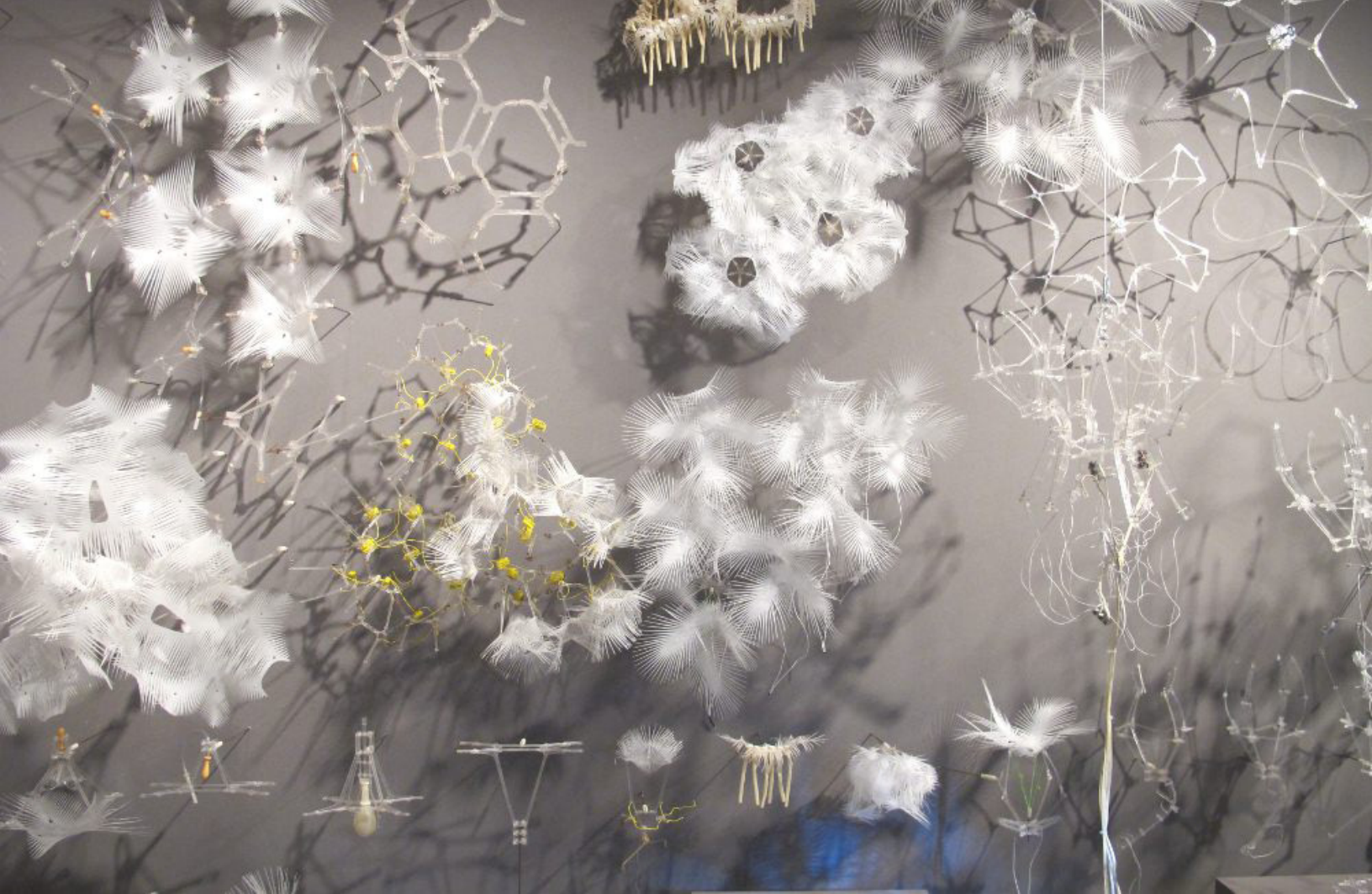
2 Hylozoic Ground Collaboration: Cambridge Galleries - Cambridge, Canada - 2011